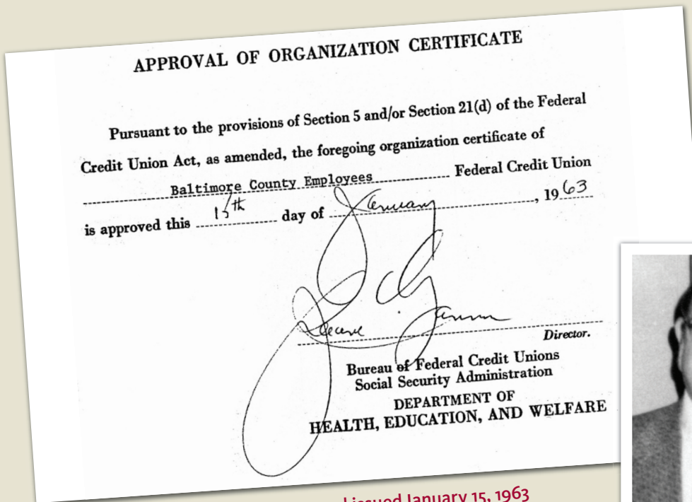
Charter approval issued January 15, 1963